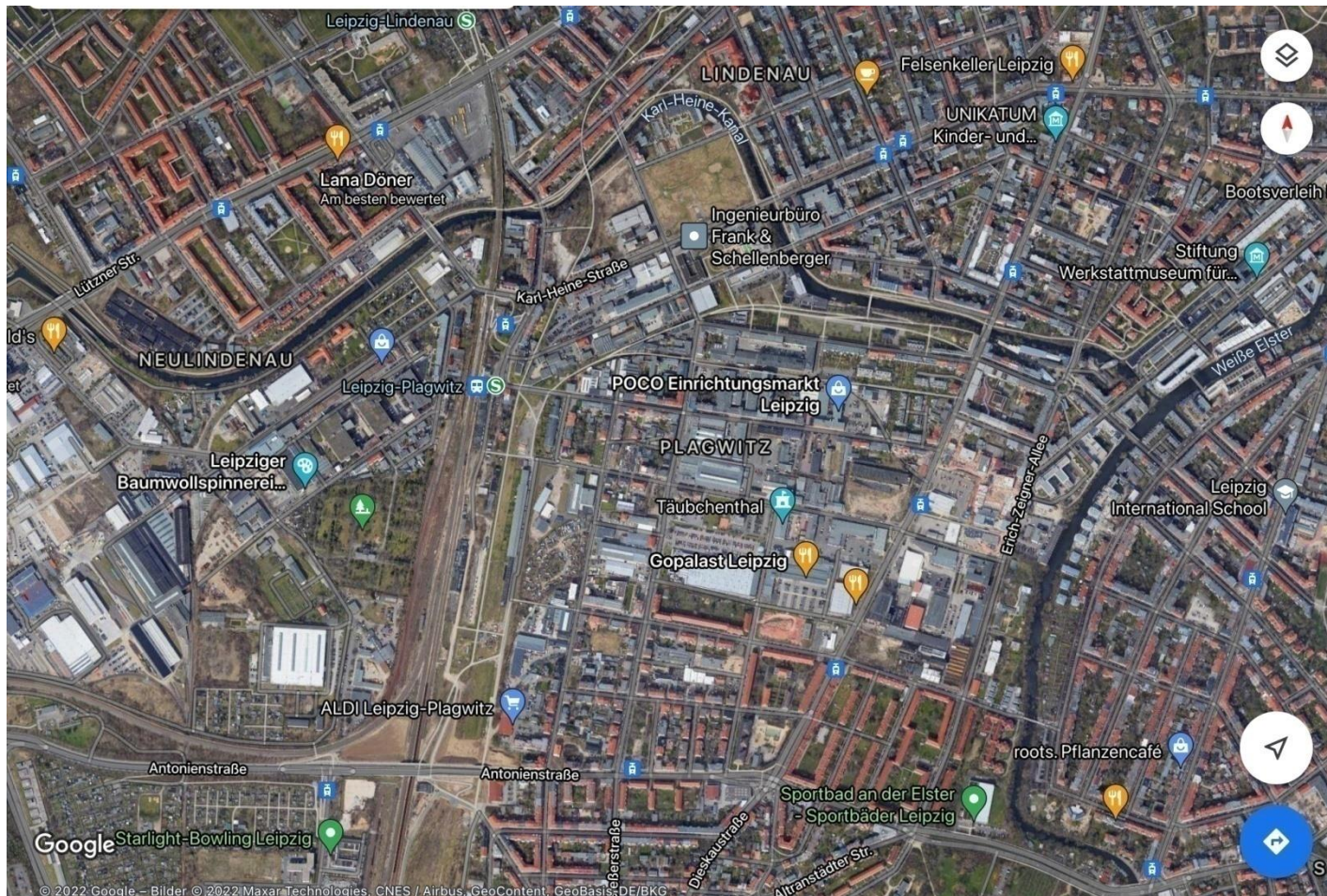
Figure 1: City map of the Karl-Heine-Canal